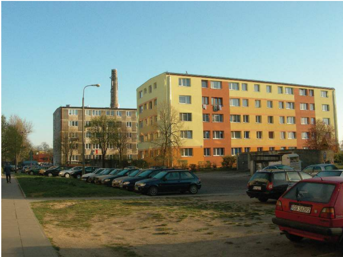
Photograph B showing area B for Question 2